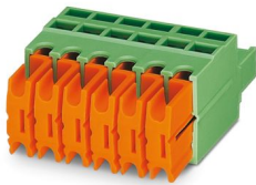
The figure shows a 6-position version

PCB connector, nominal cross section: 1 mm 2 , color: green, nominal current: 10 A, rated voltage (III/2): 630 V, contact surface: Sn, contact connection type: Socket, number of potentials: 3, number of rows: 1, number of positions: 3, number of connections: 3, product range: QC 1/..-ST-BUS, pitch: 5 mm, connection method: Displacement connection, conductor/PCB connection direction: 90 °, locking clip: - Locking clip, plug-in system: COMBICON MSTB 2,5, locking: without, mounting method: without, type of packaging: packed in cardboard, The plug allows conductors to be looped through from module to module, without interruption