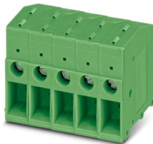
Figure shows the product in green

Printed circuit board terminal, nominal current: 32 A, rated voltage (III/2): 630 V, nominal cross section: 4 mm 2 , number of potentials: 1, number of rows: 1, number of positions per row: 1, product range: FRONT 4-H, pitch: 7.62 mm, connection method: Front screw connection, mounting: Wave soldering, conductor/PCB connection direction: 0 °, color: gray, Pin layout: Linear pinning, Solder pin [P]: 5 mm, number of solder pins per potential: 2, type of packaging: packed in cardboard