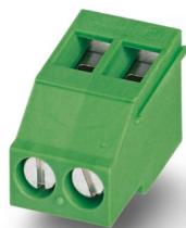
The figure shows a 2-pos. version of the product

Printed circuit board terminal, nominal current: 24 A, rated voltage (III/2): 400 V, nominal cross section: 2.5 mm 2 , number of potentials: 4, number of rows: 1, number of positions per row: 4, product range: MKDSF 3, pitch: 5 mm, connection method: Screw connection with tension sleeve, screw head form: L Slotted, mounting: Wave soldering, conductor/PCB connection direction: 90 °, color: black, Pin layout: Linear pinning, Solder pin [P]: 4.1 mm, number of solder pins per potential: 1, type of packaging: packed in cardboard. The article can be aligned to create different nos. of positions!