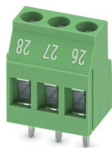
The figure shows a 2-position version

Printed circuit board terminal, nominal current: 24 A, rated voltage (III/2): 400 V, nominal cross section: 2.5 mm 2 , number of potentials: 3, number of rows: 1, number of positions per row: 3, product range: MKDS 3, pitch: 5 mm, connection method: Screw connection with tension sleeve, screw head form: L Slotted, mounting: Wave soldering, conductor/PCB connection direction: 0 °, color: green, Pin layout: Linear pinning, Solder pin [P]: 5 mm, number of solder pins per potential: 1, type of packaging: packed in cardboard. The article can be aligned to create different nos. of positions!