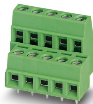
The figure shows a 5-position version

PCB terminal block, nominal current: 13.5 A, rated voltage (III/2): 400 V, nominal cross section: 1.5 mm 2 , number of potentials: 20, number of rows: 2, number of positions per row: 10, product range: MKKDSN 1,5, pitch: 5.08 mm, connection method: Screw connection with tension sleeve, screw head form: L Slotted, mounting: Wave soldering, conductor/PCB connection direction: 0 °, color: green, Pin layout: Linear pinning, Solder pin [P]: 3.5 mm, number of solder pins per potential: 1, type of packaging: packed in cardboard. The article can be aligned to create different nos. of positions!