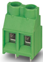
The figure shows a 2-pos. version of the product

Printed circuit board terminal, nominal current: 32 A, rated voltage (III/2): 630 V, nominal cross section: 4 mm 2 , number of potentials: 3, number of rows: 1, number of positions per row: 3, product range: MKDS 5, pitch: 7.62 mm, connection method: Screw connection with tension sleeve, screw head form: L Slotted, mounting: Wave soldering, conductor/PCB connection direction: 0 °, color: green, Pin layout: Linear pinning, Solder pin [P]: 5 mm, number of solder pins per potential: 1, type of packaging: packed in cardboard