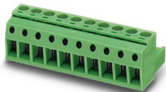
The figure shows the 10-pos. green version of the article

PCB connector, nominal cross section: 2.5 mm 2 , color: agate gray, nominal current: 12 A, rated voltage (III/2): 320 V, contact surface: Au, contact connection type: Socket, number of potentials: 5, number of rows: 1, number of positions: 5, number of connections: 5, product range: MSTBP 2,5/..-ST, pitch: 5.08 mm, connection method: Screw connection with tension sleeve, screw head form: L Slotted, conductor/PCB connection direction: 0 °, locking clip: - Locking clip, plug-in system: COMBICON MSTB 2,5, locking: without, mounting method: without, type of packaging: packed in cardboard