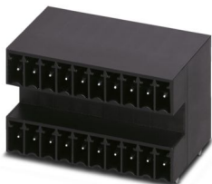
The figure shows the unprinted 10-pos. version

PCB headers, nominal cross section: 1.5 mm 2 , color: black, nominal current: 8 A, rated voltage (III/2): 160 V, contact surface: Sn, contact connection type: Pin, number of potentials: 8, number of rows: 2, number of positions: 4, number of connections: 8, product range: MCD 1,5/..-G2, pitch: 3.5 mm, mounting: Wave soldering, pin layout: Linear pinning, solder pin [P]: 3.5 mm, number of solder pins per potential: 1, plug-in system: COMBICON MC 1,5, Pin connector pattern alignment: Standard, locking: without, mounting method: without, type of packaging: packed in cardboard