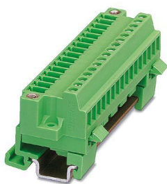
The figure shows a 16-position version

DIN rail connector, nominal cross section: 1.5 mm 2 , color: green, nominal current: 8 A, rated voltage (III/2): 160 V, contact surface: Sn, contact connection type: Pin, number of potentials: 6, number of rows: 1, number of positions: 6, number of connections: 6, product range: MCVK 1,5/..-GF, pitch: 3.81 mm, connection method: Screw connection with tension sleeve, screw head form: L Slotted, mounting: DIN rail mounting, conductor/PCB connection direction: 0 °, plug-in system: COMBICON MC 1,5, locking: Screw locking mechanism, mounting method: Threaded flange, type of packaging: packed in cardboard