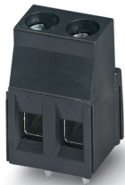
The figure shows a 2-pos. version of the product

Printed circuit board terminal, nominal current: 16 A, rated voltage (III/2): 320 V, nominal cross section: 2.5 mm 2 , number of potentials: 4, number of rows: 1, number of positions per row: 4, product range: MKDSN 2,5/..-HT, pitch: 5.08 mm, connection method: Screw connection with tension sleeve, screw head form: L Slotted, mounting: THR soldering / wave soldering, conductor/PCB connection direction: 0 °, color: black, Pin layout: Linear pinning, Solder pin [P]: 3.5 mm, number of solder pins per potential: 1, type of packaging: packed in cardboard