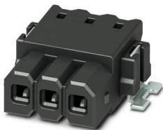
The figure shows a 3-position version

PCB headers, nominal cross section: 0.5 mm 2 , color: black, nominal current: 6 A, rated voltage (III/2): 160 V, contact surface: Sn, contact connection type: Socket, number of potentials: 6, number of rows: 1, number of positions: 6, number of connections: 6, product range: PTSM 0,5/..-HHI-SMD, pitch: 2.5 mm, mounting: SMD soldering, pin layout: Linear pad geometry, number of solder pins per potential: 1, plug-in system: COMBICON PTSM, Pin connector pattern alignment: Standard, locking: without, mounting method: without, type of packaging: 44 mm wide tape