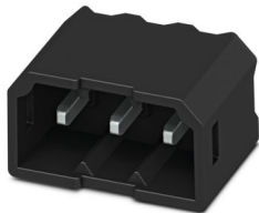
The figure shows the 3-pos. version

PCB headers, nominal cross section: 0.5 mm 2 , color: black, nominal current: 6 A, rated voltage (III/2): 160 V, contact surface: Sn, contact connection type: Pin, number of potentials: 6, number of rows: 1, number of positions: 6, number of connections: 6, product range: PTSM 0,5/..-HH-THR, pitch: 2.5 mm, mounting: THR soldering / wave soldering, pin layout: Linear pinning, solder pin [P]: 2 mm, number of solder pins per potential: 1, plug-in system: COMBICON PTSM, Pin connector pattern alignment: Standard, locking: without, mounting method: without, type of packaging: 32 mm wide tape, Article with anti-rotation pin