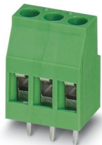
The figure shows a 3-position version

Printed circuit board terminal, nominal current: 24 A, rated voltage (III/2): 400 V, nominal cross section: 2.5 mm 2 , number of potentials: 4, number of rows: 1, number of positions per row: 4, product range: MKDSP 3, pitch: 5 mm, connection method: Screw connection with tension sleeve, screw head form: L Slotted, mounting: Wave soldering, conductor/PCB connection direction: 0 °, color: green, Pin layout: Linear pinning, Solder pin [P]: 5 mm, number of solder pins per potential: 1, type of packaging: packed in cardboard