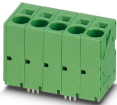
The figure shows a 5-position version

Printed circuit board terminal, nominal current: 76 A, rated voltage (III/2): 1000 V, nominal cross section: 16 mm 2 , number of potentials: 2, number of rows: 1, number of positions per row: 2, product range: SPT 16/..-V, pitch: 10 mm, connection method: Push-in spring connection, mounting: Wave soldering, conductor/PCB connection direction: 90 °, color: multicolored, Pin layout: Zigzag pinning W, Solder pin [P]: 4.1 mm, number of solder pins per potential: 3, type of packaging: packed in cardboard