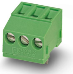
The figure shows a 2-pos. version of the product

Printed circuit board terminal, nominal current: 17.5 A, rated voltage (III/2): 400 V, nominal cross section: 1.5 mm 2 , number of potentials: 3, number of rows: 1, number of positions per row: 3, product range: MKDSFW 1,5, pitch: 5 mm, connection method: Screw connection with tension sleeve, screw head form: L Slotted, mounting: Wave soldering, conductor/PCB connection direction: 90 °, color: gray, Pin layout: Linear pinning, Solder pin [P]: 5 mm, number of solder pins per potential: 1, type of packaging: packed in cardboard