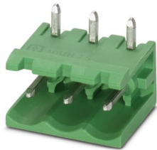
The figure shows a product version of the article

PCB headers, nominal cross section: 2.5 mm 2 , color: green, nominal current: 12 A, rated voltage (III/2): 320 V, contact surface: Sn, contact connection type: Pin, number of potentials: 9, number of rows: 1, number of positions: 9, number of connections: 9, product range: MSTB 2,5/..-GU, pitch: 5 mm, mounting: Wave soldering, pin layout: Linear pinning, solder pin [P]: 3. 3 mm, number of solder pins per potential: 1, plug-in system: COMBICON MSTB 2,5, Pin connector pattern alignment: reversed, locking: without, mounting method: without, type of packaging: packed in cardboard