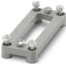
D-SUB adapter plate, for one D-SUB connector, no. of positions 25, housing series HC-D 15...

Please be informed that the data shown in this PDF document is generated from our online catalog. Please find the complete data in the user documentation. Our general terms of use for downloads are valid.