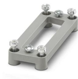
D-SUB adapter plate, for one D-SUB connector, no. of positions 15, housing series HC-D 15...

Please be informed that the data shown in this PDF document is generated from our online catalog. Please find the complete data in the user documentation. Our general terms of use for downloads are valid.