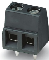
The figure shows a 2-position version

Printed circuit board terminal, nominal current: 13.5 A, rated voltage (III/2): 320 V, nominal cross section: 1.5 mm 2 , number of potentials: 8, number of rows: 1, number of positions per row: 8, product range: MKDSN 1,5/...-HT, pitch: 5 mm, connection method: Screw connection with tension sleeve, screw head form: L Slotted, mounting: THR soldering / wave soldering, conductor/PCB connection direction: 0 °, color: black, Pin layout: Linear pinning, Solder pin [P]: 3.5 mm, number of solder pins per potential: 1, type of packaging: packed in cardboard