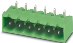
The figure shows 6-position versions

PCB headers, nominal cross section: 2.5 mm 2 , color: black, nominal current: 12 A, rated voltage (III/2): 320 V, contact surface: Sn, contact connection type: Pin, number of potentials: 3, number of rows: 1, number of positions: 3, number of connections: 3, product range: MSTBA 2,5/..-GU, pitch: 5 mm, mounting: Wave soldering, pin layout: Linear pinning, solder pin [P]: 3. 23 mm, number of solder pins per potential: 1, plug-in system: COMBICON MSTB 2,5, Pin connector pattern alignment: reversed, locking: without, mounting method: without, type of packaging: packed in cardboard