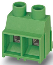
The figure shows a 2-pos. version of the product

PCB terminal block, nominal current: 32 A, rated voltage (III/2): 1000 V, nominal cross section: 4 mm 2 , number of potentials: 2, number of rows: 1, number of positions per row: 2, product range: MKDS 5 HV, pitch: 9.52 mm, connection method: Screw connection with tension sleeve, screw head form: L Slotted, mounting: Wave soldering, conductor/PCB connection direction: 0 °, color: black, Pin layout: Zigzag pinning M, Solder pin [P]: 5.2 mm, number of solder pins per potential: 1, type of packaging: packed in cardboard