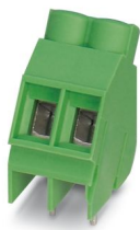
The figure shows a 2-pos. version of the product

PCB terminal block, nominal current: 32 A, rated voltage (III/2): 630 V, nominal cross section: 4 mm 2 , number of rows: 1, number of positions per row: 2, product range: SMKDS 5, pitch: 6.35 mm, connection method: Screw connection with tension sleeve, screw head form: L Slotted, mounting: Wave soldering, conductor/PCB connection direction: 35 °, Pin layout: Linear pinning, Solder pin [P]: 5 mm, number of solder pins per potential: 1, type of packaging: packed in cardboard