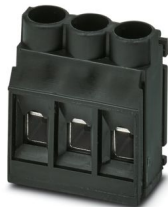
The figure shows a 3-pos. version of the product

Printed circuit board terminal, nominal current: 32 A, rated voltage (III/2): 630 V, nominal cross section: 4 mm 2 , number of potentials: 3, number of rows: 1, number of positions per row: 3, product range: MKDSO 5/..-L, pitch: 6.35 mm, connection method: Screw connection with tension sleeve, screw head form: Z2L Slotted Pozidriv, mounting: Wave soldering, conductor/PCB connection direction: 0 °, color: black, Pin layout: Linear pinning, Solder pin [P]: 3 mm, number of solder pins per potential: 1, type of packaging: packed in cardboard