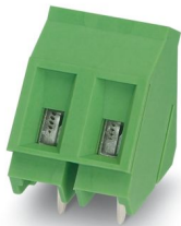
The figure shows a 2-pos. version of the product

Printed circuit board terminal, nominal current: 24 A, rated voltage (III/2): 630 V, nominal cross section: 2.5 mm 2 , number of potentials: 6, number of rows: 1, number of positions per row: 6, product range: GSMKDS 3, pitch: 7.5 mm, connection method: Screw connection with tension sleeve, screw head form: L Slotted, mounting: Wave soldering, conductor/PCB connection direction: 55 °, color: green, Pin layout: Linear pinning, Solder pin [P]: 4.5 mm, number of solder pins per potential: 1, type of packaging: packed in cardboard