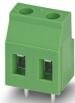
The figure shows a 2-pos. version of the product

PCB terminal block, nominal current: 24 A, rated voltage (III/2): 630 V, nominal cross section: 2.5 mm 2 , number of potentials: 3, number of rows: 1, number of positions per row: 3, product range: GMKDSP 3, pitch: 7.5 mm, connection method: Screw connection with tension sleeve, screw head form: L Slotted, mounting: Wave soldering, conductor/PCB connection direction: 0 °, color: green, Pin layout: Linear pinning, Solder pin [P]: 5 mm, number of solder pins per potential: 1, type of packaging: packed in cardboard. The article can be aligned to create different nos. of positions!