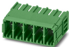
The figure shows a 5-pos. version of the product in green

PCB headers, nominal cross section: 6 mm 2 , color: orange, nominal current: 32 A, rated voltage (III/2): 630 V, contact surface: Sn, contact connection type: Pin, number of rows: 1, number of positions: 4, product range: PC 5/..-G, pitch: 7.62 mm, mounting: Wave soldering, pin layout: Linear pinning, solder pin [P]: 3.4 mm, number of solder pins per potential: 3, plug-in system: COMBICON PC 5, Pin connector pattern alignment: Standard, locking: without, mounting method: without, type of packaging: packed in cardboard