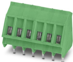
The figure shows a 6-position version

Printed circuit board terminal, nominal current: 24 A, rated voltage (III/2): 400 V, nominal cross section: 2.5 mm 2 , number of potentials: 3, number of rows: 1, number of positions per row: 3, product range: SMKDS 3, pitch: 5.08 mm, connection method: Screw connection with tension sleeve, screw head form: L Slotted, mounting: Wave soldering, conductor/PCB connection direction: 55 °, color: green, Pin layout: Linear pinning, Solder pin [P]: 4.5 mm, number of solder pins per potential: 1, type of packaging: packed in cardboard. The article can be aligned to create different nos. of positions!