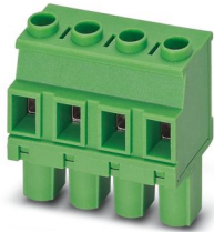
The figure shows an 4-pos. version in green

PCB connector, nominal cross section: 2.5 mm 2 , color: green, nominal current: 12 A, rated voltage (III/2): 630 V, contact surface: Sn, contact connection type: Socket, number of potentials: 4, number of rows: 1, number of positions: 4, number of connections: 4, product range: GMVSTBW 2,5 HV/...-ST, pitch: 7.62 mm, connection method: Screw connection with tension sleeve, screw head form: L Slotted, conductor/PCB connection direction: -90 °, locking clip: - Locking clip, plug-in system: COMBICON MSTB 2,5 HC, locking: without, mounting method: without, type of packaging: packed in cardboard