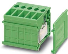
Figure shows the product in green

Printed circuit board terminal, nominal current: 32 A, rated voltage (III/2): 320 V, nominal cross section: 4 mm 2 , number of potentials: 2, number of rows: 1, number of positions per row: 2, product range: FRONT 4-V, pitch: 6.35 mm, connection method: Front screw connection, mounting: Wave soldering, conductor/PCB connection direction: 90 °, color: black, Pin layout: Linear pinning, Solder pin [P]: 5 mm, number of solder pins per potential: 2, type of packaging: packed in cardboard. The article can be aligned to create different nos. of positions!