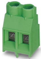
The figure shows a 2-pos. version of the product

Printed circuit board terminal, nominal current: 32 A, rated voltage (III/2): 630 V, nominal cross section: 4 mm 2 , number of potentials: 2, number of rows: 1, number of positions per row: 2, product range: MKDSV 5, pitch: 7.62 mm, connection method: Screw connection with tension sleeve, screw head form: L Slotted, mounting: Wave soldering, conductor/PCB connection direction: 0 °, color: gray, Pin layout: Linear pinning, Solder pin [P]: 5.1 mm, number of solder pins per potential: 1, type of packaging: packed in cardboard