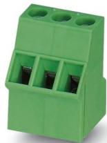
The figure shows a 3-position version

Printed circuit board terminal, nominal current: 20 A, rated voltage (III/2): 400 V, nominal cross section: 2.5 mm 2 , number of potentials: 3, number of rows: 1, number of positions per row: 3, product range: SMKDS 2,5, pitch: 5.08 mm, connection method: Screw connection with tension sleeve, screw head form: L Slotted, mounting: Wave soldering, conductor/PCB connection direction: 50 °, color: green, Pin layout: Linear pinning, Solder pin [P]: 4.5 mm, number of solder pins per potential: 1, type of packaging: packed in cardboard