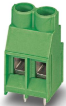
The figure shows a 2-pos. version of the product

Printed circuit board terminal, nominal current: 32 A, rated voltage (III/2): 630 V, nominal cross section: 4 mm 2 , number of potentials: 4, number of rows: 1, number of positions per row: 4, product range: MKDS 5, pitch: 6.35 mm, connection method: Screw connection with tension sleeve, screw head form: L Slotted, mounting: Wave soldering, conductor/PCB connection direction: 0 °, color: white, Pin layout: Linear pinning, Solder pin [P]: 5.1 mm, number of solder pins per potential: 1, type of packaging: packed in cardboard