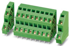
The figure shows a 10-position version

Printed circuit board terminal, nominal current: 16 A, rated voltage (III/2): 400 V, nominal cross section: 1.5 mm 2 , number of potentials: 12, number of rows: 2, number of positions per row: 6, product range: ZFKKDS(A) 1,5C, pitch: 5 mm, connection method: Spring-cage connection, mounting: Wave soldering, conductor/PCB connection direction: 45 °, color: green, Pin layout: Linear pinning, Solder pin [P]: 3.7 mm, number of solder pins per potential: 1, type of packaging: packed in cardboard