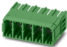
The figure shows a 5-pos. version of the product in green

PCB headers, nominal cross section: 6 mm 2 , color: green, nominal current: 32 A, rated voltage (III/2): 630 V, contact surface: Sn, contact connection type: Pin, number of rows: 1, number of positions: 2, product range: PC 5/..-G, pitch: 7.62 mm, mounting: Wave soldering, pin layout: Linear pinning, solder pin [P]: 2.6 mm, number of solder pins per potential: 3, plug-in system: COMBICON PC 5, Pin connector pattern alignment: Standard, locking: without, mounting method: without, type of packaging: packed in cardboard