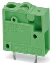
The figure shows a 1-pos. version of the product

PCB terminal block, nominal current: 24 A, rated voltage (III/2): 630 V, nominal cross section: 2.5 mm 2 , number of potentials: 1, number of rows: 1, number of positions per row: 1, product range: GKDS/E, pitch: 7.5 mm, connection method: Screw connection with tension sleeve, screw head form: L Slotted, mounting: Wave soldering, conductor/PCB connection direction: 0 °, color: black, Pin layout: Linear pinning, Solder pin [P]: 5 mm, number of solder pins per potential: 2, type of packaging: packed in cardboard