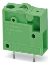
The figure shows a 1-pos. version of the product

PCB terminal block, nominal current: 24 A, rated voltage (III/2): 630 V, nominal cross section: 2.5 mm 2 , number of potentials: 1, number of rows: 1, number of positions per row: 1, product range: GKDS/E, pitch: 7.5 mm, connection method: Screw connection with tension sleeve, screw head form: L Slotted, mounting: Wave soldering, conductor/PCB connection direction: 0 °, color: black, Pin layout: Linear pinning, Solder pin [P]: 5 mm, number of solder pins per potential: 2, type of packaging: packed in cardboard