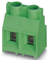
The figure shows a 2-pos. version of the product

Printed circuit board terminal, nominal current: 32 A, rated voltage (III/2): 1000 V, nominal cross section: 4 mm 2 , number of potentials: 3, number of rows: 1, number of positions per row: 3, product range: MKDS 5, pitch: 9.52 mm, connection method: Screw connection with tension sleeve, screw head form: L Slotted, mounting: Wave soldering, conductor/PCB connection direction: 0 °, color: green, Pin layout: Linear pinning, Solder pin [P]: 5 mm, number of solder pins per potential: 1, type of packaging: packed in cardboard