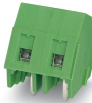
The figure shows a 2-pos. version of the product

PCB terminal block, nominal current: 17.5 A, rated voltage (III/2): 630 V, nominal cross section: 1.5 mm 2 , number of rows: 1, number of positions per row: 12, product range: GSMKDSP 1,5, pitch: 7.62 mm, connection method: Screw connection with tension sleeve, mounting: Wave soldering, conductor/PCB connection direction: 55 °, color: green, number of solder pins per potential: 1