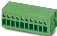
The figure shows an 10-position version

Printed circuit board terminal, nominal current: 24 A, rated voltage (III/2): 400 V, nominal cross section: 2.5 mm 2 , number of potentials: 5, number of rows: 1, number of positions per row: 5, product range: FRONT 2,5-H/SA 5, pitch: 5 mm, connection method: Front screw connection, mounting: Wave soldering, conductor/PCB connection direction: 0 °, color: light gray, Pin layout: Linear pinning, Solder pin [P]: 3.5 mm, number of solder pins per potential: 2, type of packaging: packed in cardboard