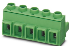
The figure shows the 5-position version of the product

PCB connector, nominal cross section: 2.5 mm 2 , color: green, nominal current: 16 A, rated voltage (III/2): 1000 V, contact surface: Sn, contact connection type: Socket, number of potentials: 4, number of rows: 1, number of positions: 4, number of connections: 4, product range: GMSTB 2,5 HCV/...-ST, pitch: 7.62 mm, connection method: Screw connection with tension sleeve, screw head form: L Slotted, conductor/PCB connection direction: 0 °, locking clip: - Locking clip, plug-in system: COMBICON MSTB 2,5 HC, locking: without, mounting method: without, type of packaging: packed in cardboard