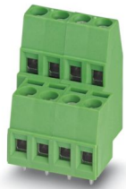
The figure shows a 4-position version

PCB terminal block, nominal current: 17.5 A, rated voltage (III/2): 400 V, nominal cross section: 1.5 mm 2 , number of rows: 2, number of positions per row: 2, product range: MKKDS 1,5, pitch: 5 mm, connection method: Screw connection with tension sleeve, screw head form: L Slotted, mounting: Wave soldering, conductor/PCB connection direction: 0 °, color: gray, Pin layout: Linear pinning, Solder pin [P]: 3.5 mm, number of solder pins per potential: 1, type of packaging: packed in cardboard