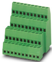
The figure shows a combination as a 15-position version

Printed circuit board terminal, nominal current: 15 A, rated voltage (III/2): 400 V, nominal cross section: 1.5 mm 2 , number of potentials: 8, number of rows: 4, number of positions per row: 2, product range: MK4DS 1,5, pitch: 5.08 mm, connection method: Screw connection with tension sleeve, screw head form: L Slotted, mounting: Wave soldering, conductor/PCB connection direction: 0 °, color: black, Pin layout: Linear pinning, Solder pin [P]: 3.5 mm, number of solder pins per potential: 1, type of packaging: packed in cardboard