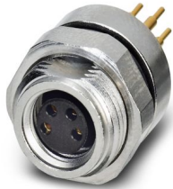
Device connector rear mounting, 4-position, Socket, straight, M8, A-coding, Wave soldering

Please be informed that the data shown in this PDF document is generated from our online catalog. Please find the complete data in the user documentation. Our general terms of use for downloads are valid.