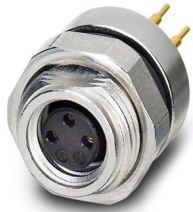
Device connector rear mounting, 3-position, Socket, straight, M8, A-coding, Wave soldering

Please be informed that the data shown in this PDF document is generated from our online catalog. Please find the complete data in the user documentation. Our general terms of use for downloads are valid.