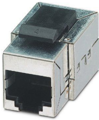
RJ45 socket insert, modular (Keystone), CAT3, 8-pos., shielded, with cable connection (IDC)

Please be informed that the data shown in this PDF document is generated from our online catalog. Please find the complete data in the user documentation. Our general terms of use for downloads are valid.