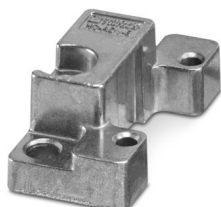
Panel-mount flange for HEAVYCON ADVANCE housing

Please be informed that the data shown in this PDF document is generated from our online catalog. Please find the complete data in the user documentation. Our general terms of use for downloads are valid.