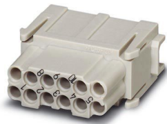
HEAVYCON contact insert module, female, 12-pos., crimp connection

https://www.phoenixcontact.com/us/products/1663323