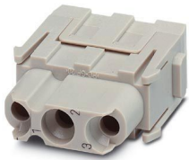
HEAVYCON contact insert module, female, 3-pos., crimp connection

https://www.phoenixcontact.com/us/products/1663226