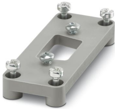
D-SUB adapter plate, for one D-SUB connector, no. of positions 9, housing series HC-D 15...

Please be informed that the data shown in this PDF document is generated from our online catalog. Please find the complete data in the user documentation. Our general terms of use for downloads are valid.