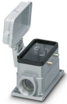
HEAVYCON box mounting base B10, for double locking latch, height 52 mm, with supports 2xM20, with cover

Please be informed that the data shown in this PDF document is generated from our online catalog. Please find the complete data in the user documentation. Our general terms of use for downloads are valid.