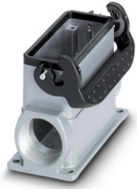
HEAVYCON box mounting base B16, with single locking latch, height 84 mm, with supports 2xM40

Please be informed that the data shown in this PDF document is generated from our online catalog. Please find the complete data in the user documentation. Our general terms of use for downloads are valid.