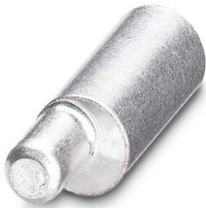
Cable lug for HEAVYCON-MODULAR; PE connection extension to 16 mm 2 , for crimping with crimp pliers

Please be informed that the data shown in this PDF document is generated from our online catalog. Please find the complete data in the user documentation. Our general terms of use for downloads are valid.